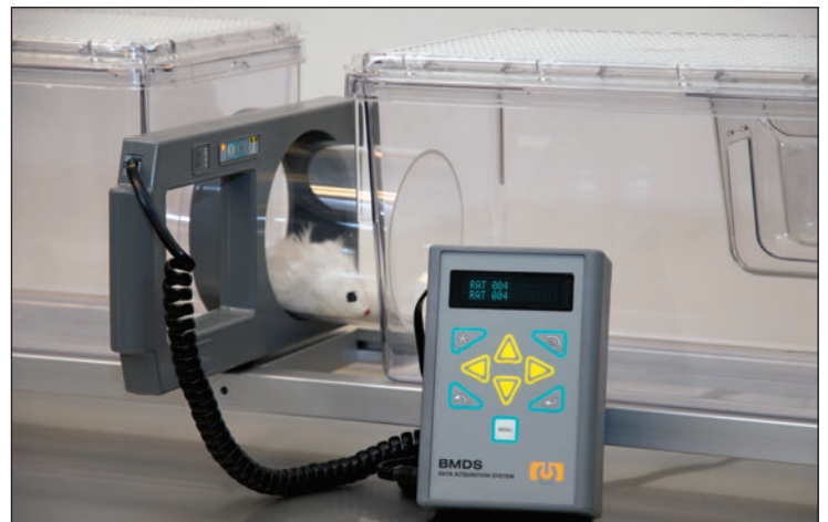
Ring Reader with tunnel for connection of cages. Can be used in behavior studies.