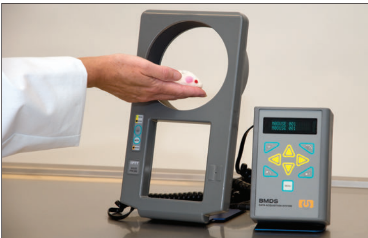
RR-6004/5 with DAS-6003